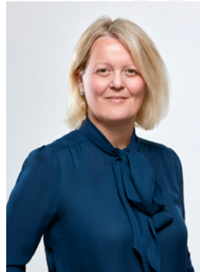
Alison Rose DBE, Chief Executive of NatWest Group