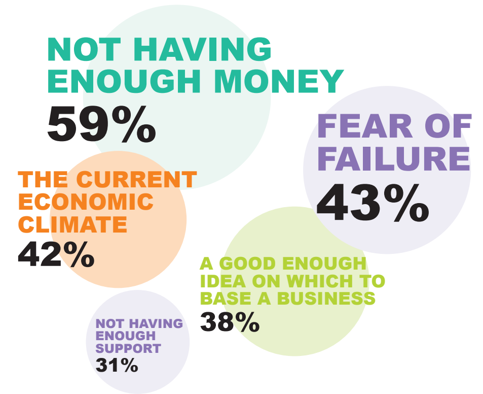
Figure 2: Which, if any, of the following barriers would prevent you from starting a business?

Although one in three young people (33 per cent) dreams of setting up in business, many are being held back due to worries about funding or not having enough support. The Prince's Trust Enterprise programme helps young people to overcome these barriers and fulfil their ambitions of becoming self-employed.